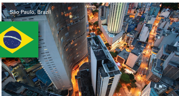
São Paulo, Brazil